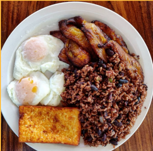
Here's a typical Nicaraguan breakfast we may be expected to eat. (eggs, fried plantains, gallo pinto and fritanga).

We are excited to see what God will do through us in Nicaragua. We will be learning Nicaraguan Sign Language and Spanish. We will also be learning their culture, and with God's help, we will try our best to adapt to the culture there.