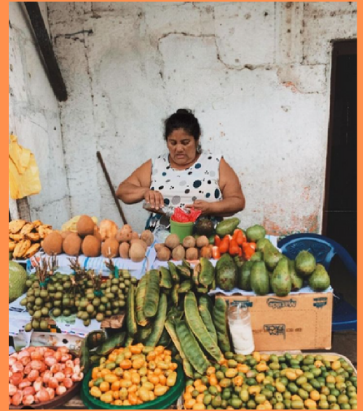
A seller at a city market